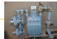
Stop #7 .25 psig (7 inH2O) Residential service

Images and pressures are representative and are not intended to reflect actual equipment or pressures used.