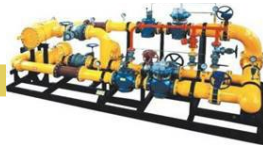
Stop #1 230 psig typical Citygate pressure reduction station 100-150 psig typical Power generator plants