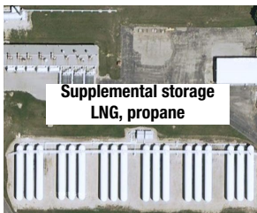
Supplemental storage LNG, propane