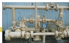
Stop #5 30 psig typical Industrial User Transfer Station