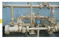
Stop #2 30 psig typical up to 60 psig Metering & Regulator Station