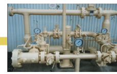
Stop #3 30 psig typical Sampling & Regulator Station