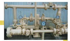
Stop #4 30 psig typical Residential Transfer Station