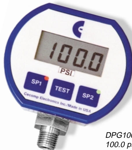
DPG1000ADA with 100.0 psig range

Compensated temperature . . . . . 0 to +70°C